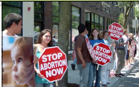
Pro-Life Students from Drake University

Why not start your own pro-life club? Iowa Right to Life has plenty of resources for your club, including flyers, pamphlets, posters, fetal models, books and DVDs.