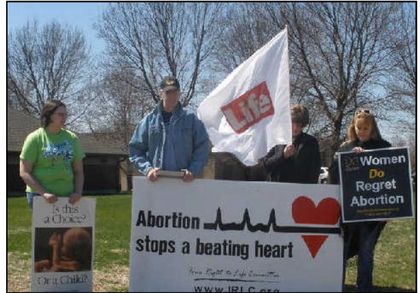
Volunteers pray outside Planned Parenthood in Urbandale, which is now offering abortions.

College in Clinton, also four-year college, Ashford University)