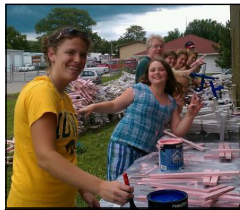
Our future: young pro-lifers volunteer at Iowa Right to Life.

We are seeing it here in Iowa—there are many teenagers volunteering and the college pro-life groups are growing, as evidenced by the Pro-Life Conference recently organized by Iowa State Uni-