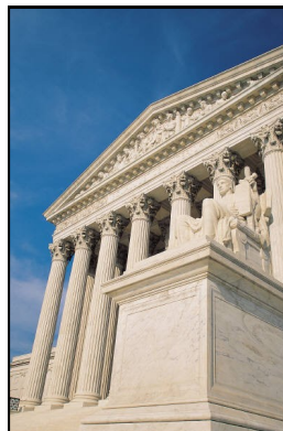
Meadows' testimony in the Carhart case revealed her barbaric work as a late-term abortionist.